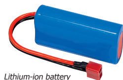
Lithium-ion battery réf. 027411

When the vehicle battery has no residual voltage, the lithium-ion battery (ref. 027411) is used, on demand, to pre-charge the supercapacitors.