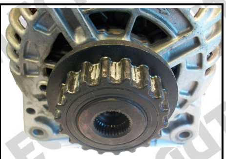
Uneven wear marks caused by incorrect fitting of alternator.

If this is not done in the correct way then it will result in the 'Eurogrip coupling / Cog belt' not being aligned correctly and becoming worn and also causing the clutch pulley to fail.