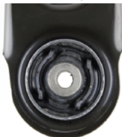
New improved design