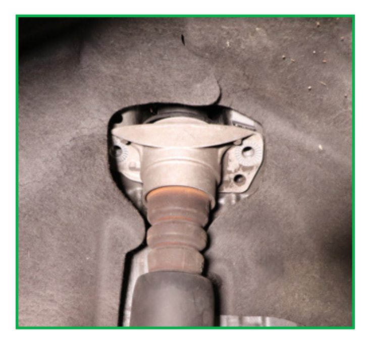
FIGURE 4 FIGURE 5