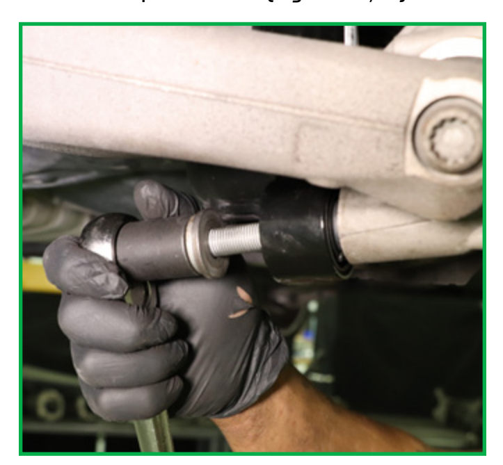
FIGURE 13 FIGURE 14