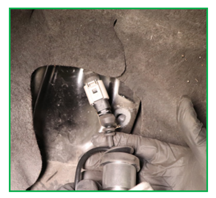
FIGURE 10 FIGURE 11