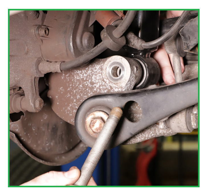
FIGURE 6 FIGURE 7