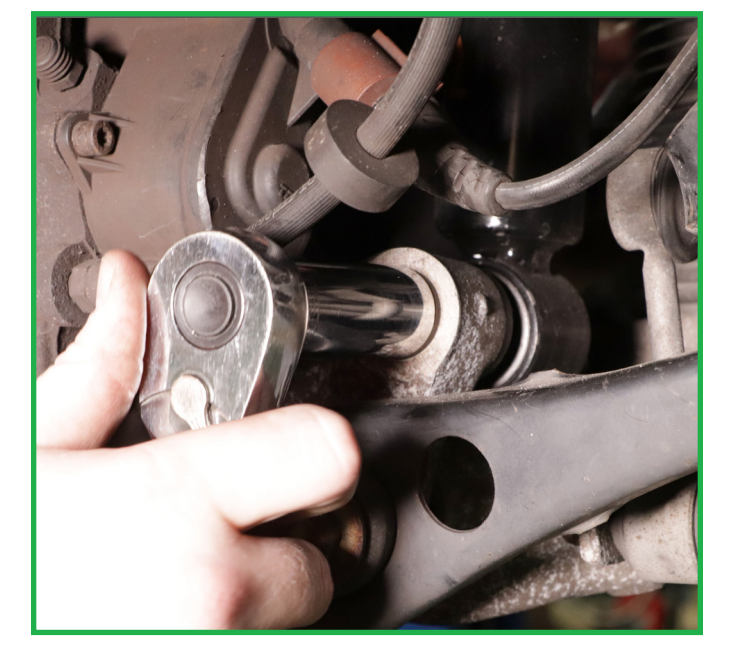
FIGURE 10 FIGURE 11

6 SK-3561 Installation Manual REV 01 April 13, 2022