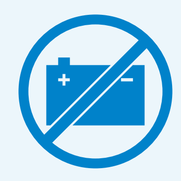
WARNING HIGH VOLTAGE: DISCONNECT BATTERY