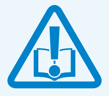
ALWAYS REFER TO MANUFACTURERS INSTRUCTIONS