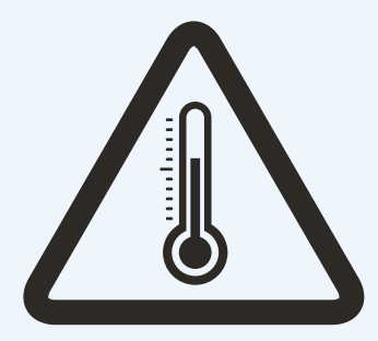
ENSURE ENGINE IS COOL BEFORE STARTING