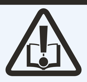
ALWAYS REFER TO MANUFACTURERS INSTRUCTIONS

After replacing engine management components, many vehicles will require a reset of the parameters to tell the ECU that a new part has been fitted. Without this, the ECU will believe that the engine is still running with faulty sensors and will default back to data already received before the replacement. This causes the vehicle to run poorly, normally with the Malfunction Indicator Lamp on and the fault code still logged in memory.