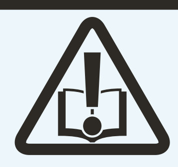
ALWAYS REFER TO MANUFACTURERS INSTRUCTIONS

After replacing engine management components, many vehicles will require a reset of the parameters to tell the ECU that a new part has been fitted. Without this, the ECU will believe that the engine is still running with faulty sensors and will default back to data already received before the replacement. This causes the vehicle to run poorly, normally with the Malfunction Indicator Lamp on and the fault code still logged in memory.