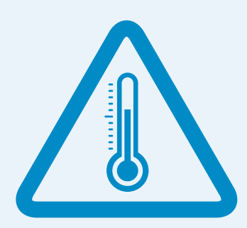
ENSURE ENGINE IS COOL BEFORE STARTING