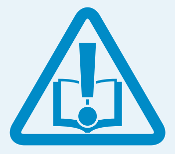
ALWAYS REFER TO MANUFACTURERS INSTRUCTIONS