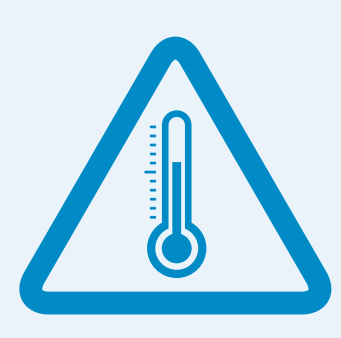
ENSURE ENGINE IS COOL BEFORE STARTING