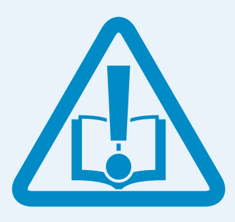
ALWAYS REFER TO MANUFACTURERS INSTRUCTIONS