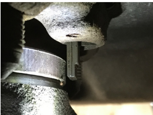
Fig. 2 Brake disc and sensor correctly installed

With the old brake disc removed from the vehicle, the wheel speed sensor should be inspected for excess corrosion surrounding the mounting area. It is important to note that any excess metal corrosion can alter the position of the sensor – affecting its functionality. This can lead to direct contact with the reluctor, causing damage to the new brake disc assembly (Fig.1). Subsequently, an increased air gap between the sensor and the reluctor can also occur, resulting in an anti-lock brake system fault – logged as a sensor implausibility signal fault code in the brake control unit.