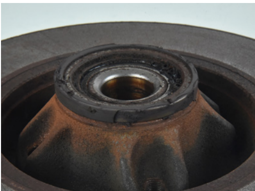
Fig. 1 Damaged reluctor due to contact with the sensor

Many Peugeot, Citroën and DS models are equipped with rear brake discs that have an integrated wheel bearing. As a result, this type of assembly allows for significant weight saving, since the brake disc also becomes the wheel hub. This pre-assembled part also makes replacement quicker and easier for the workshop, whilst eliminating the risk of mounting a bearing with incorrect clearance or seal positioning.