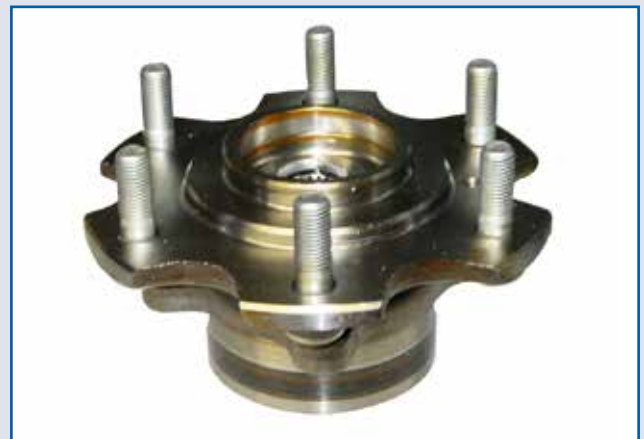
Correct position of washer