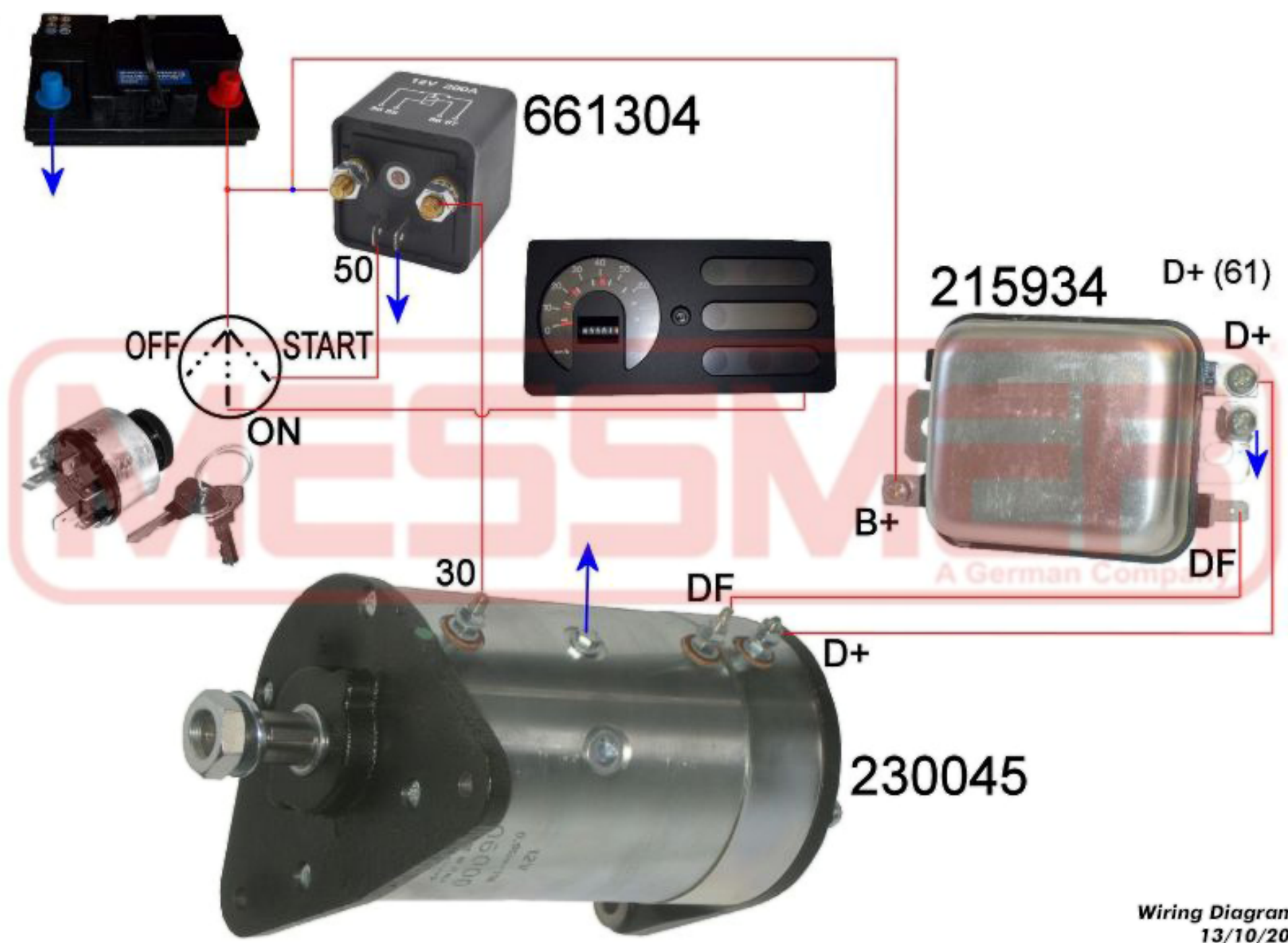
Wiring Diagram 1 13/10/2017