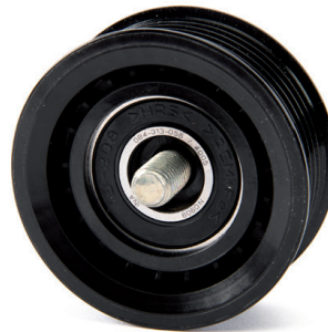
Fig. 2: 532 0471 10 - new design