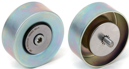
Fig. 1: Deflection pulleys with old seal design

For the vehicles listed above, Schaeffler Automotive Aftermarket offers a deflection pulley with a new seal design (Fig. 2).