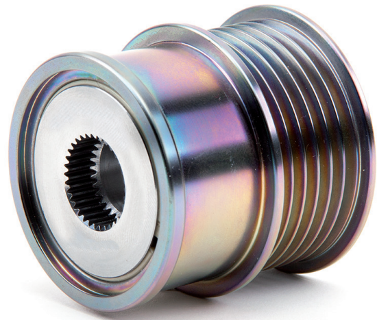
Fig. 1: 535 0279 10 – INA overrunning alternator pulley

OE number: 04E 903 201 04E 903 201 A 04E 903 201 E 8V0 903 119 8V0 903 119 A