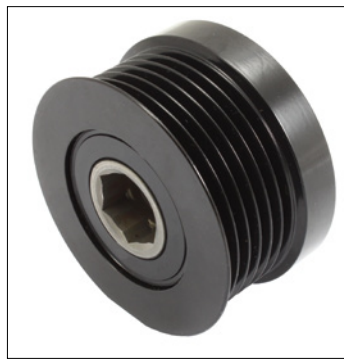
Figure 1: Previous design