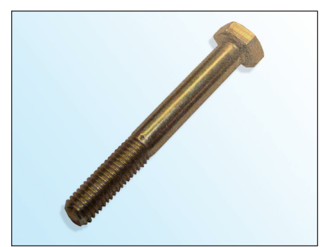
Fig. 2: OE bolt

As part of the continuous development of our products and quality assurance, LuK AS now supplies a new bolt (fig. 3) with the tensioning pulley 531 0278 30 .