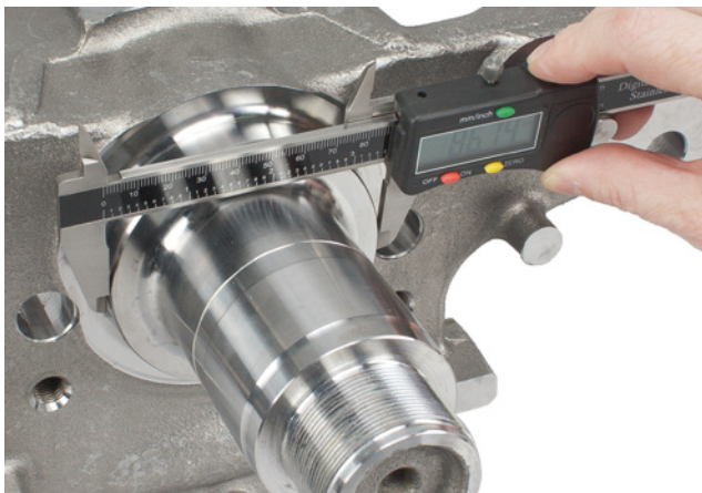
Figure 2: To determine which of the three protective rings needs to be installed, the diameter of the sealing seat must be measured

When identifying the part, please note that there are three different variants. To identify the correct protective ring, the diameter of the sealing seat must be measured.