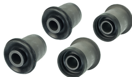
MEYLE-Nr.: 36-14 710 0001/HD