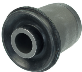
MEYLE-Nr.: 36-14 710 0000/HD