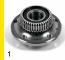
Passive impulse wheel located on wheel end

*This type of impulse wheel is difficult to identify with the naked eye and requires special care when handling and installing. Check MOOG ESB "Wheel End Bearings with integrated magnetic ABS impulse wheels" for more information