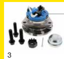
Integrated impulse wheel & ABS sensor