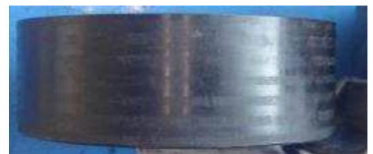
Marks on the pulley

If the belt becomes incorrectly tensioned and moves on the pulley roller, and becomes misaligned. When this happens the polyamide part of the pulley becomes marked and damaged , in some cases the edge of the pulley wears. This wear may allow the belt to slide of the pulley in some situations.