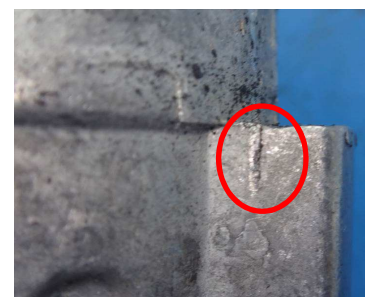
Marks on the stop

Tensioner GA357.04 is not designed to absorb the violent shocks caused by the bouncing and snatching of the belt. This bouncing and snatching motion prematurely wears the internal elements of the tensioner.