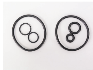
Figure 2: The thinner gaskets for OX 183/5D (left) and the thicker gaskets for OX 183/5D1 (right)