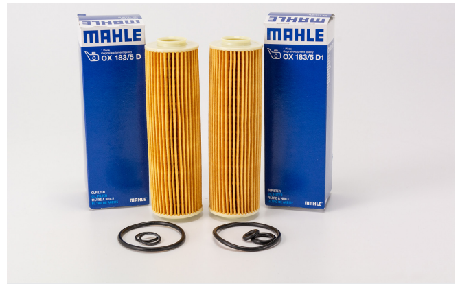
Figure 1: At first glance, the two versions appear identical

Fitting gaskets that are too thick is often either not possible at all or only with extra effort—which risks breaking off the mandrel on the oil filter housing cover, requiring its complete replacement.