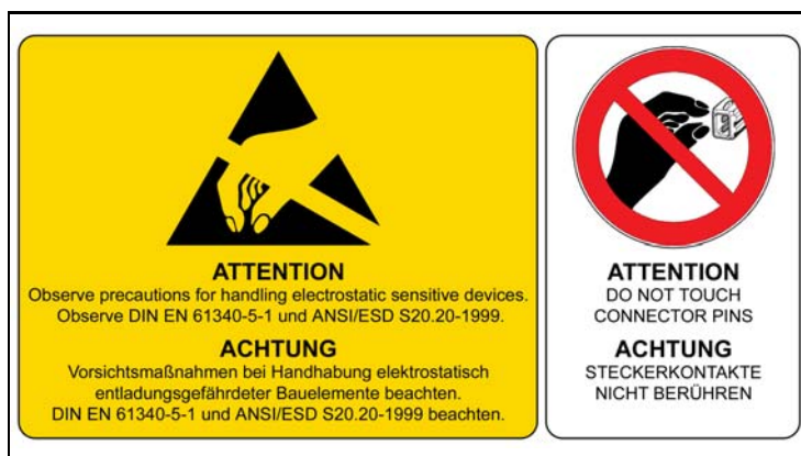
4 - ESD Hinweise / ESD Notes