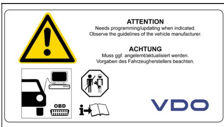
3 - Montage Hinweise / Installation Notes

Nennspannung (Positionssensor) / Nominal Voltage (Position Sensor) = 5 V