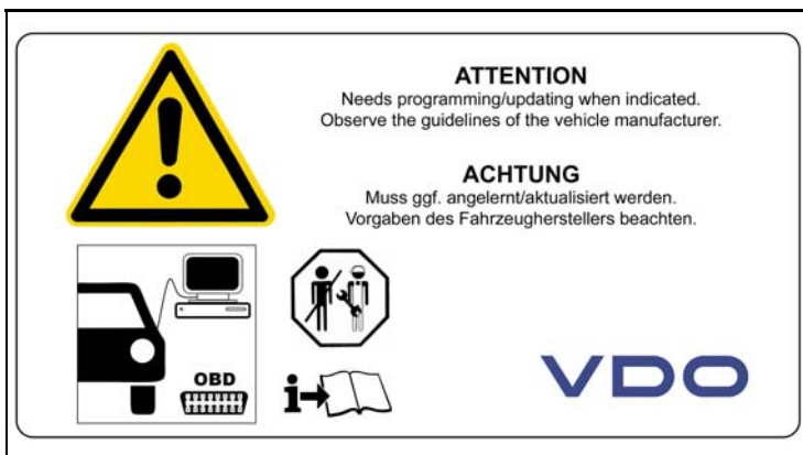
3 - Montage Hinweise / Installation Notes

Nennspannung (Positionssensor) / Nominal Voltage (Position Sensor) = 5 V