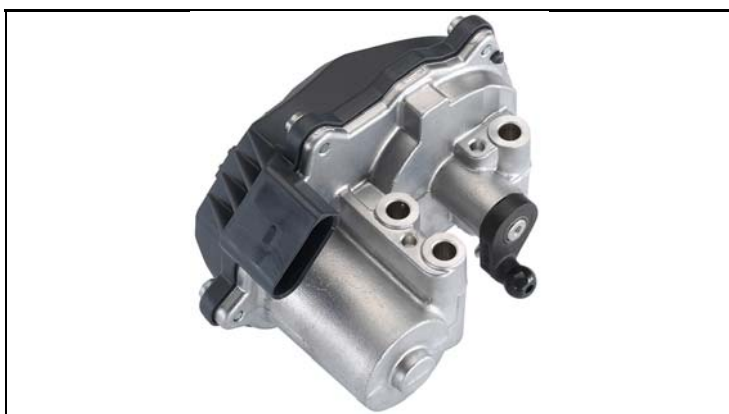
1 - Produkt / Product