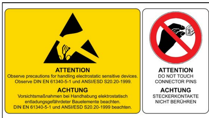
4 - ESD Hinweise / ESD Notes