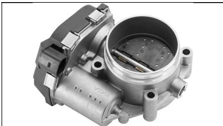
1 - Produkt / Product