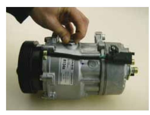
Screw in again drain screw with seal