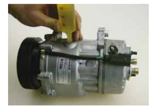
Adjust oil quantity according to manufacturer's advise