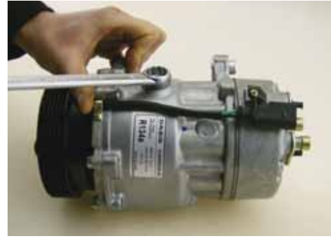
Tighten drain screw again