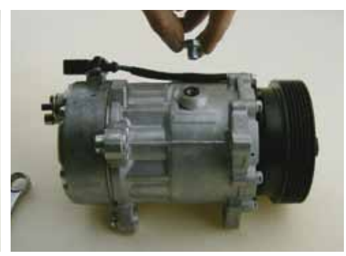
Remove drain screw