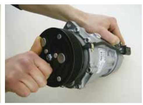
Turn clutch 5 times manually to dispose the oil all-over