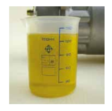
5. Let the oil flow into a measuring jug to state quantity