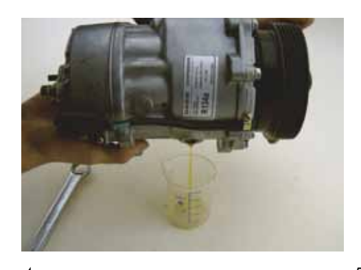
Exhaust compressor completely, turn clutch therefore