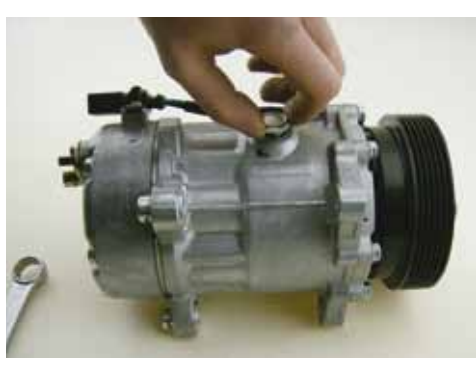
Loosen drain screw for oil carefully Turn out drain screw completely