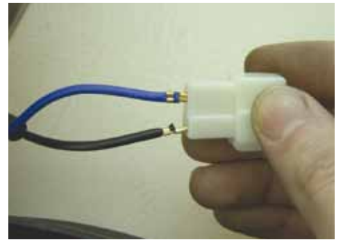
reversal; blue =+ / black =-