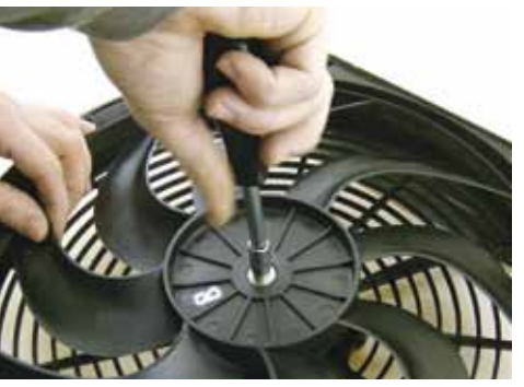
Tighten nut again (Torque: 15 Nm)