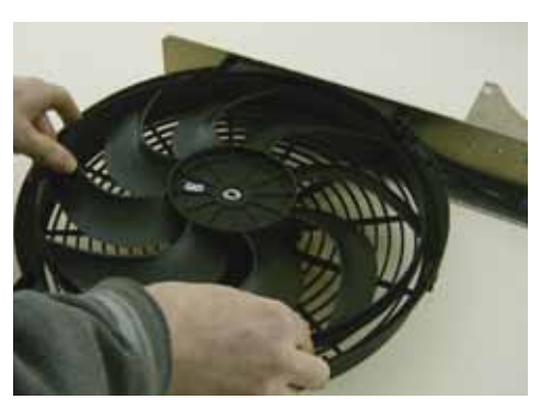
blades might be sharp edged *)