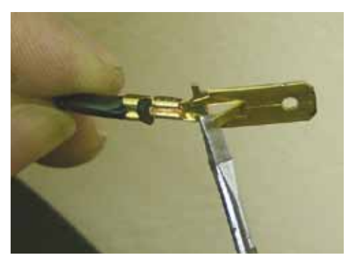
Bend lock buttons up again cautiously