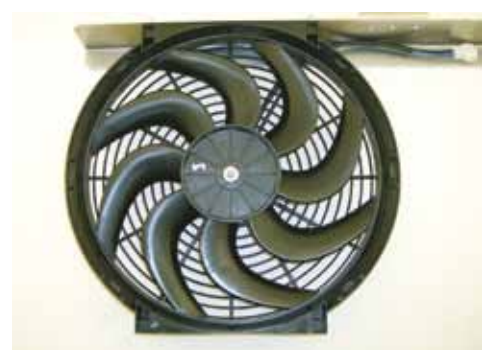
Please check, whether the ventilator was delivered sucking.