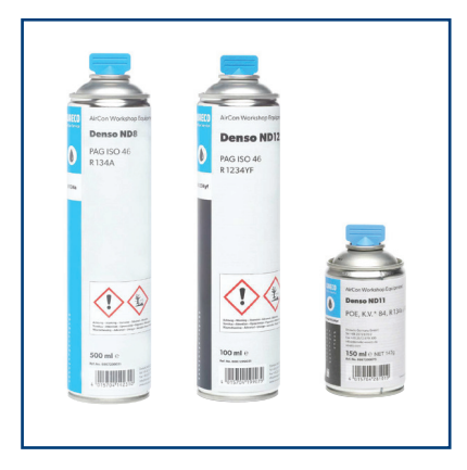
Oil type printed on can