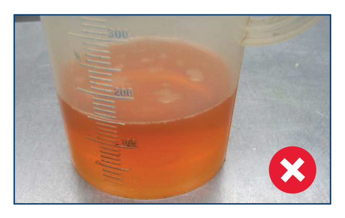
ND-oil: saturated with moisture

To keep the moisture level as low as possible, it is important to refresh the oil on a daily basis and clean the fresh oil container thoroughly, before adding new oil. The oil film inside the fresh oil container contains a lot of moisture, so cleaning before topping up is important. Compressor oil which looks like brandy is saturated with moisture. When the refilling machine is "parked" in the corner of the workshop, after the A/C season is finished, don't forget to empty and clean the oil bottles.