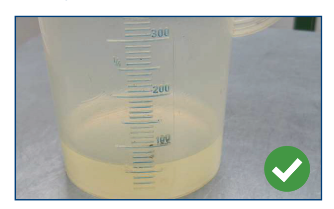
ND-oil: Clear & Transparent