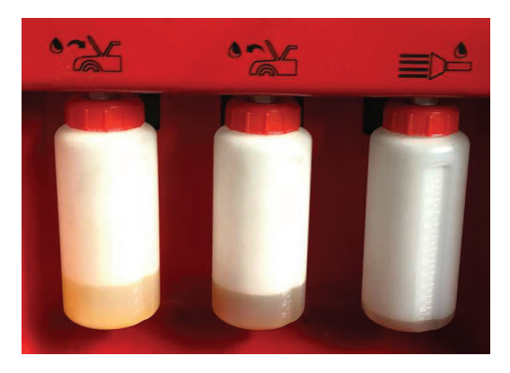
Ordinary filling bar

Most A/C refilling machines are using plastic bottles for fresh oil, old oil and UV-Dye. The problem is that most of those plastic bottles have a connection to the open air, which causes the oil to absorb moisture and age faster. In the diagram you can clearly see what the effect is on the moisture content of the oils after .. days. The maximum moisture content is 800 ppm.