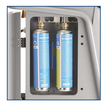
Moisture free oil feed system

A producer of A/C refilling machines offers their so called "moisture free oil feed system" to the market. In this patented oil feed system it is impossible that moisture is entering the oil during daily operation of the machine. In this way it is also clear which oil type is used during service, as it is indicated on the laminated cans.