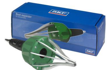
Expander tool: VKN 402

The VKJP 01018 made with stretchy rubber guarantee fast and easy assembly with the SKF air operated expander tool VKN 402, without removing the CV-joint from the shaft.