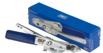
Tightening tool: VKN 400

For a professional repair when tightening the clamps, it is recommended to use the SKF tool VKN 400. Incorrect tightening of the clamps can cause premature failure of the CV-Joint!