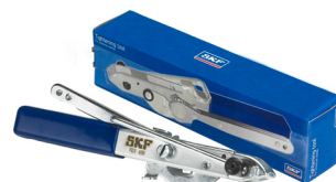
Εργαλείο σύσφιξης: VKN 400