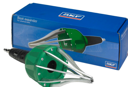
Εργαλείο διαστολής: VKN 402

Για την σύσφιξη των κολιέδων, προτείνουμε την χρήση του ειδικού εργαλείου VKN 400, μιας και η λανθασμένη σύσφιξη των κολιέδων σημαίνει μέχρι και την καταστροφή του μπιλιοφόρου!