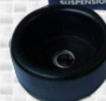
Rear axle bearing Monroe® Reference L15806