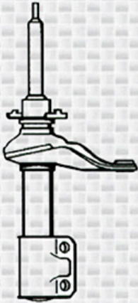
RENAULT 21 mod. 86 → 89

These shock absorbers don't fit the R 21 Petrol Turbo.