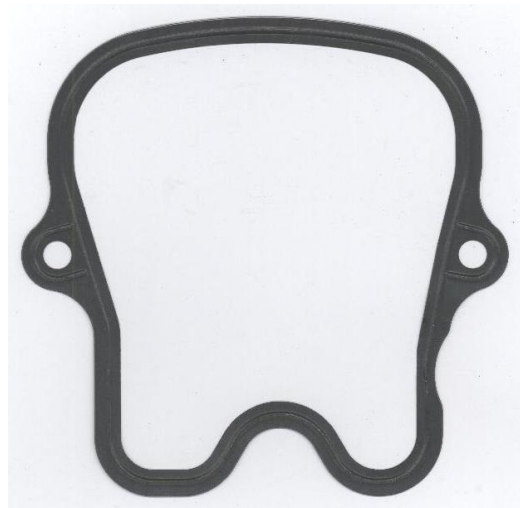
Metaloseal 0.4 mm 977.438