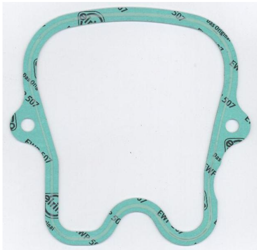
Soft material 1.5 mm 476.050

If the cam covers are not surfaced, it is recommended to install the cam cover gasket made of EWP soft material 476.050 . With a thickness of 1.5 mm, this cam cover gasket compensates for component distortion more effectively.