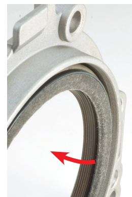
Figure 2 Sealing lip faces the engine interior