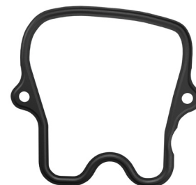
Figure 3 _VICTOR REINZ gasket 71-26428-50

Victor Reinz® – the best way to get a good gasket.