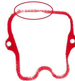
Figure 1 _Compression picture VICTOR REINZ gasket 70-26428-30 (OE 51.03905.0135)

Kind regards, Your VICTOR REINZ Service Team