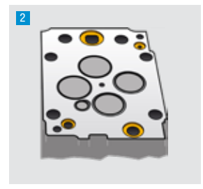
Sealing surface with cut in grooves