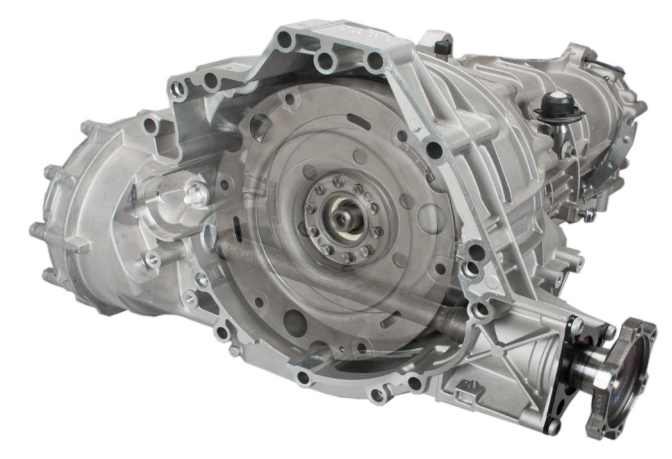
Fig. 1: The front axle flange shaft runs between the drive plate and the DMF

Handling instructions are provided with the damper modules. The brochure and the film "Repair solution for clutch modules" at www.repxpert.com also show how to use the mounting tools when carrying out the repairs.