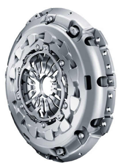
Fig. 2: Self-adjusting pressure plate with ramps and compression

In case of repairs, LuK RepSets with modified pressure plates can be used on all vehicles listed in the catalog without restriction, even where pressure plates of the previous design have been installed.