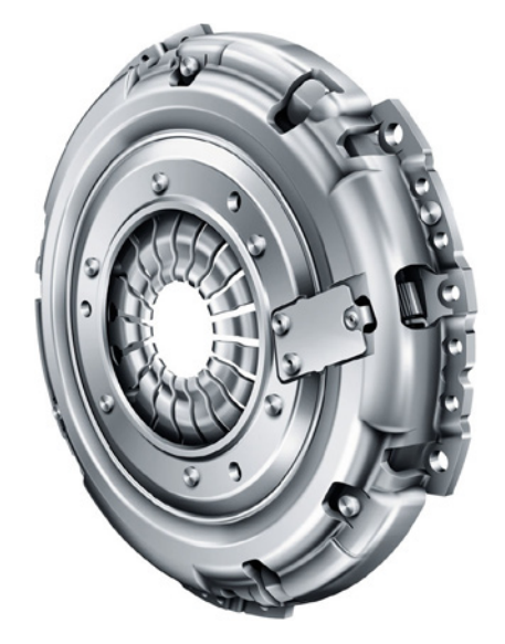
Fig. 2: Modified self-adjusting pressure plate without ramps with adjustment spring