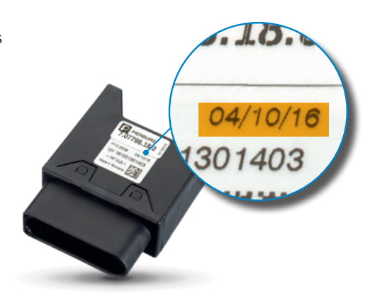
Fig. 1: Imprinted software version

Electrical components can be damaged by electrostatic supercharging. Never touch electrical contacts directly.