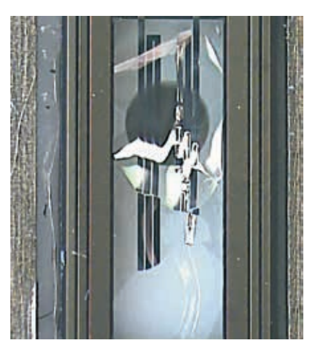
Left: The film to which the sensor elements are applied has been "bombarded" by particles.

The consequences of cleaning with compressed air