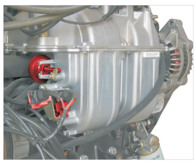
At the controlled intake manifold in the Opel Astra already two switchover valves have been fitted (highlighted in red). One controls through the actuator above it (highlighted in red) the intake manifold throttles; the other switches the secondary air shut-off valve (not shown).