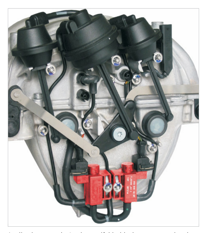
Application example: Intake manifold with electropneumatic valves (highlighted in red) as used in Mercedes-Benz C Class vehicles

In all newer vehicles often several electropneumatic valves have been built in.