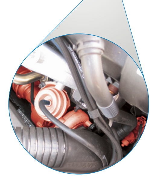
Pressure transducer and VTG charger (highlighted in red) in the Audi A4 TDI