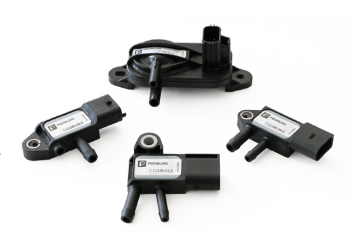
FOR ALMOST 90 MILLION VEHICLES

Due to stricter exhaust gas regulations, differential pressure sensors are increasingly being fitted to petrol particulate filters in petrol vehicles, as well.