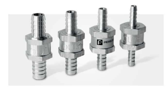
Fuel check valves 6-12 mm

Take care not to use material combinations that can lead to corrosion or contact corrosion when used with aluminium, e.g. salt water or galvanised surfaces.