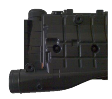
View from below

For design reasons of the air filter housing, the upper part of the housing is fastened to the lower part by four plastic clips and two screw connections. The screws are inserted into the filter from below, so that they cannot be seen.