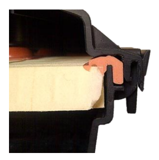
View from side