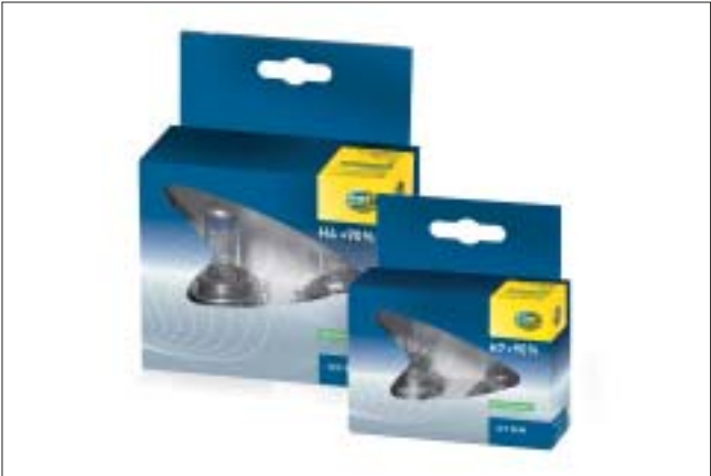
New +90% bulbs packaging design

The double packs in the blister packaging are delivered in a designed counter display, ensuring an attractive product presentation - and increased sales.