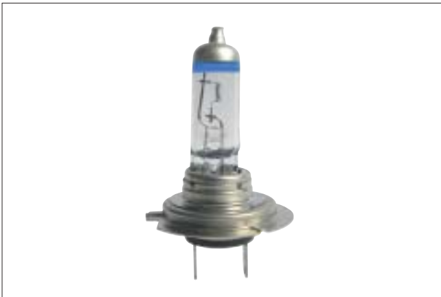
H7 +90% bulb

On the road, these Performance +90% bulbs provide up to 90% more light. This ensures greater safety by identifying obstacles and hazards earlier and quicker. This additional light / lighting also ensures better concentration and more relaxed driving.