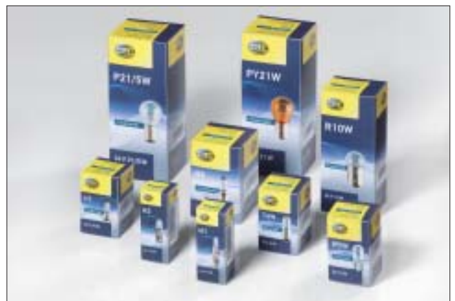
Product family bulbs