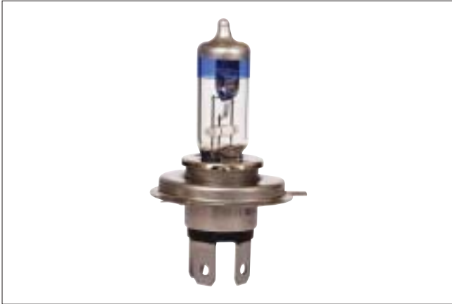
H4 +90% bulb