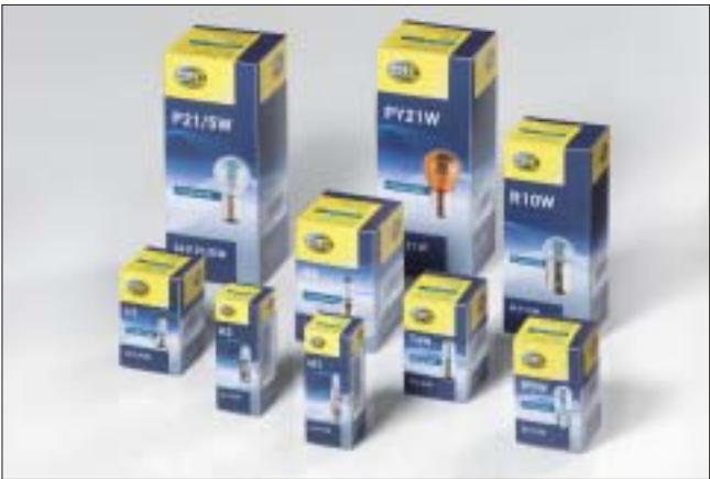
Product family bulbs